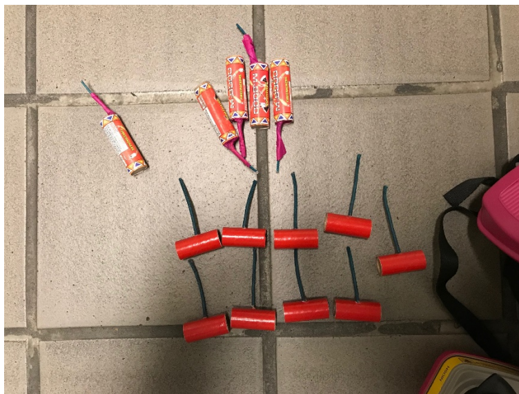
Closeup of fireworks