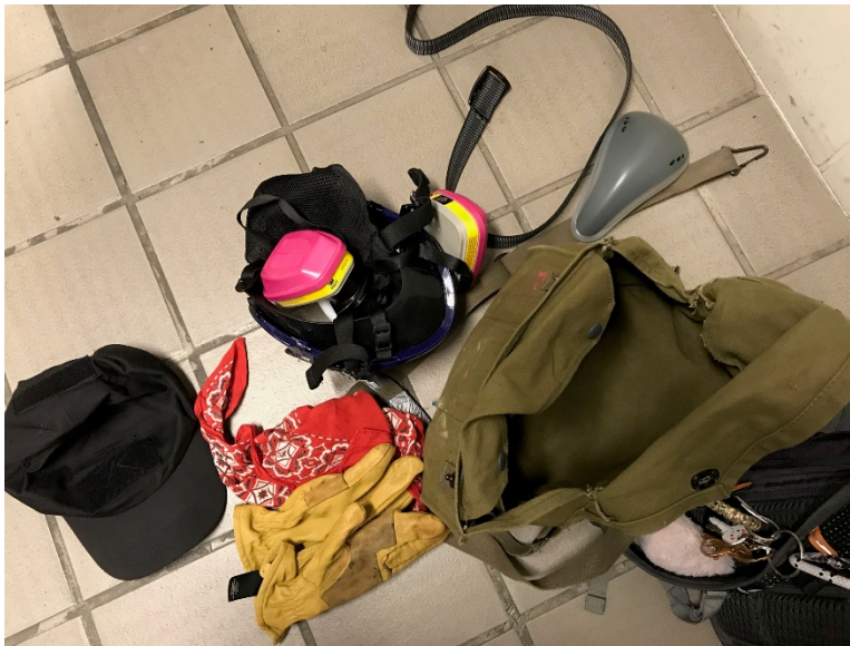
Satchel and contents

12. On July 5, 2020, DOE'S belongings were searched incident to his arrest and the following were found: a green canvas satchel containing a black hat, protective mask, red bandana, a nylon belt, and a plastic groin protector. The satchel also contained fourteen (14) commercial grade fireworks located in a small inside pocket.