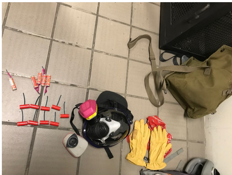
Satchel & contents including found fireworks