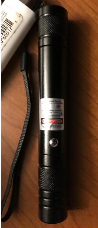
Laser found in DOE's possession.