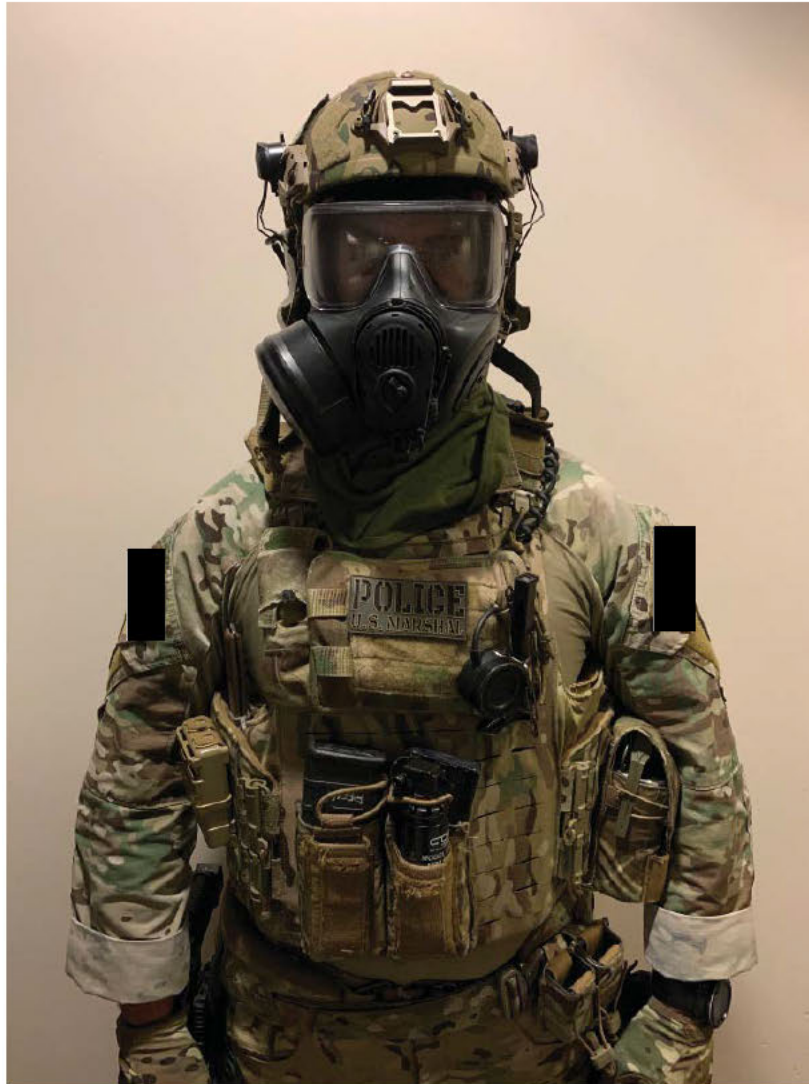
DUSM1 wearing uniform and protective gear at time of assault