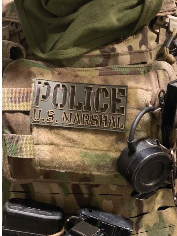
Patch identifying DUSM1 as police