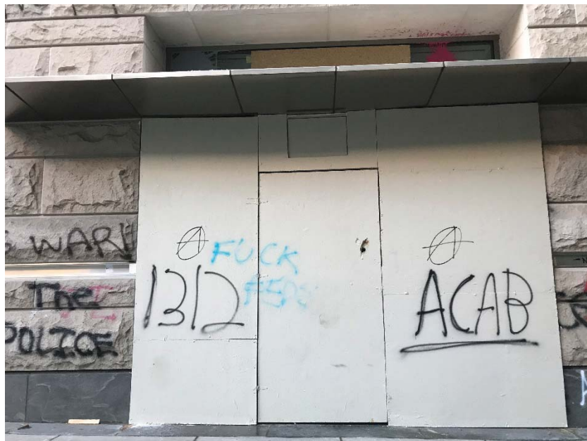
Courthouse plywood barricade with hole from GAINES' hammer strikes